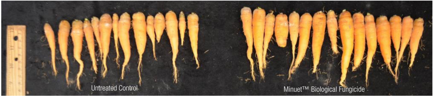
Greenhouse trials done at Bayer R&D facility in West Sacramento, CA, in 2019.