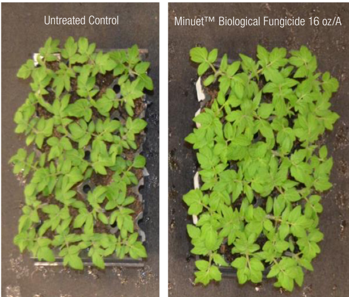
The data shown is from Bayer controlled environment and small-plot research and growers could experience different results depending on the crop management program used. Greenhouse trials done at Bayer R&D facility in West Sacramento, CA, in 2020.